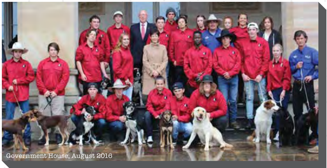
Government House, August 2016