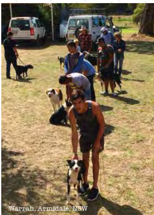
Warrah, Armidale, NSW

VFFF will purchase an 8 hectare property just outside Armidale to lease to BackTrack at $400 per week. BackTrack will run a residence for up to 10 young people on the property. They will care for the award-winning Paws Up dogs, also in residence. At any time after five years and before the eighth anniversary of our agreement, BackTrack may acquire the property from VFFF for the original purchase price of $570,000. At year eight, VFFF will offer BackTrack the first right to purchase the property for $570,000. If BackTrack do not want to buy the property, VFFF has the option to enter a new agreement with BackTrack or sell the property.